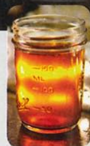
Genuine Bio-fuel makes biodiesel from recycled vegetable oil.